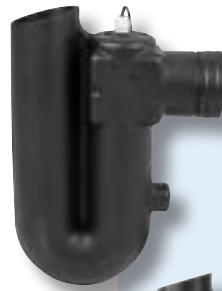
RSW-TS: Backwater guard with animal protection