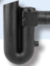
OS: Overflow siphon