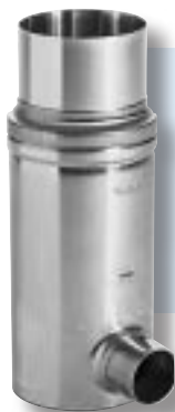
Down-pipe-filter copper or zinc