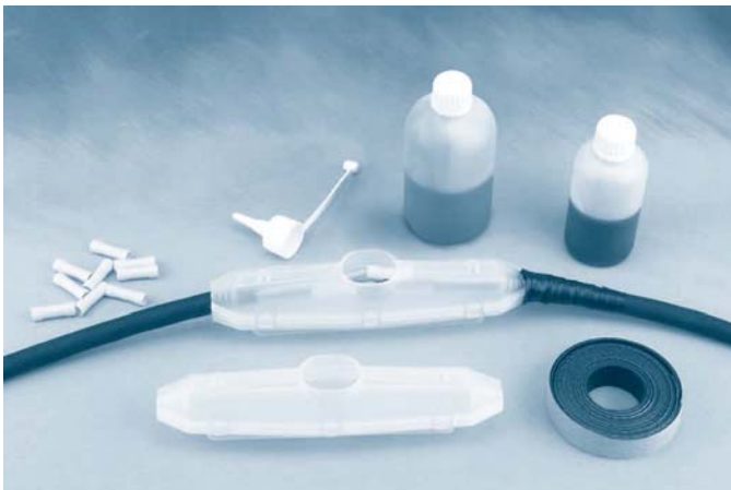
EC 04: For cables up to 4x4mm 2 EC10: For cables up to 4x10mm 2 EC25: For cables up to 4x25mm 2