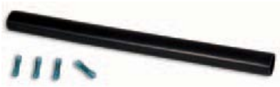
ZECH/S Heat Shrink jointing Kit 1-2.5mm 2